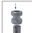
Push conduit into coupling