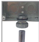
Push conduit into connector