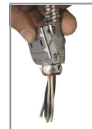
Snap in cable