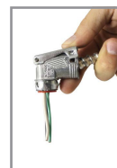
Snap in cable