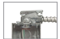
Snap into box