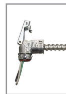
Bend to fit